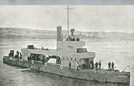
The third gunboat: Sultan