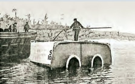
Launching the sections into the Nile, ready for assembly by the Royal Marines.