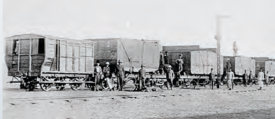
Prefabricated gunboat sections arriving by rail at Abadiya