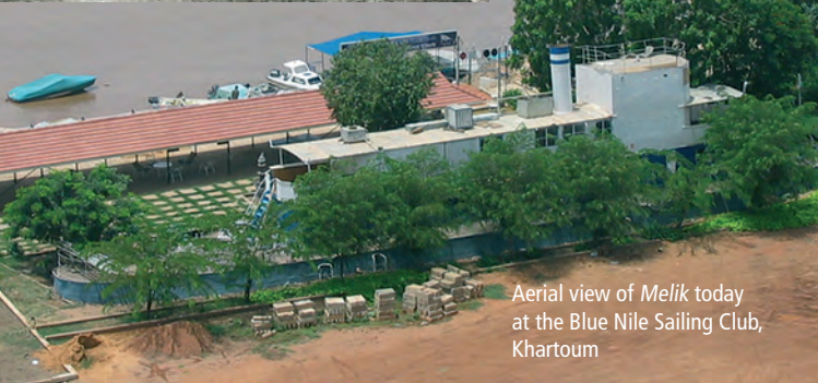
Aerial view of Melik today at the Blue Nile Sailing Club, Khartoum