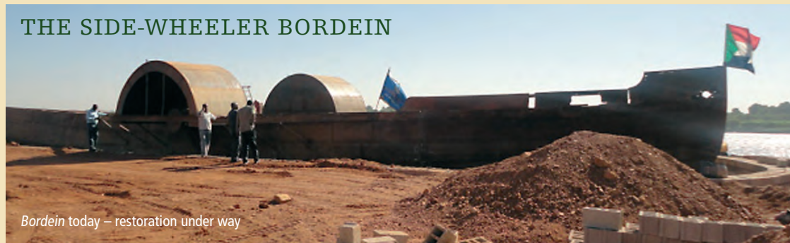
Bordein today – restoration under way