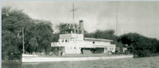
Sheikh, one of Melik's two sister gunboats