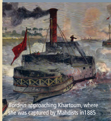
Bordein approaching Khartoum, where she was captured by Mahdists in 1885

In 2011, following representations by the Melik Society over many years, the hull of General Gordon's side-wheeler Bordein was finally rescued by Sudan's River Transport Corporation from the Khartoum North Dockyard, and moved to a heritage site on the bank of the Nile near the old Omdurman fortifications. The hull sections have since been reassembled, and a complete restoration is under way. Bordein was originally built by Samuda Bros. of Poplar in 1869 and assembled in Cairo for Sir Samuel Baker's 1871 Nile Expedition. She will become a major attraction for British and other visitors. The Society is proud to have played its part in preserving this unique steamer for future generations.